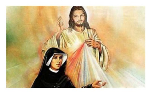
*The graces of My mercy are drawn by means of one vessel only, and that is-trust. The more a soul trusts, the more it will receive.

St. Mary of the Assumption Parish, 403 S St. Mary St., Lake Leelanau April 27, 2025