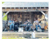
New Third Coast 12:00-1:30pm

A community drumming group from Traverse City, Deep Blue Water Samba School plays traditional Brazilian parade music on a variety of percussion instruments. This exciting group makes its debut appearance at our event, and promises to provide an energetic performance that will entertain the entire family.